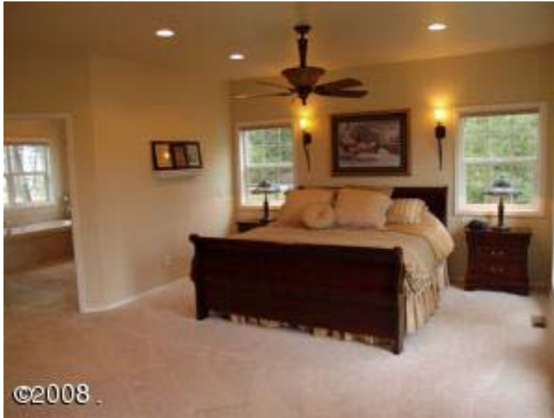
[6 of 18] Master BedroomMaster Bedroom