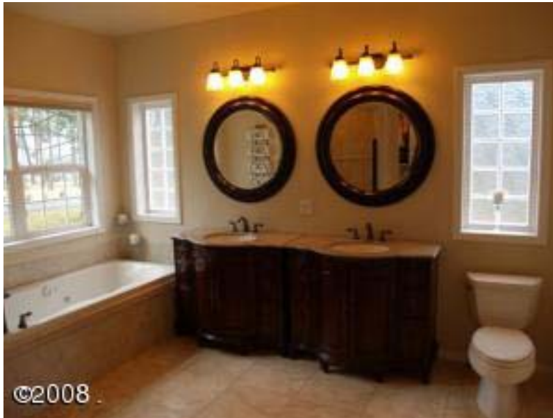
[7 of 18] Master BathMaster Bath