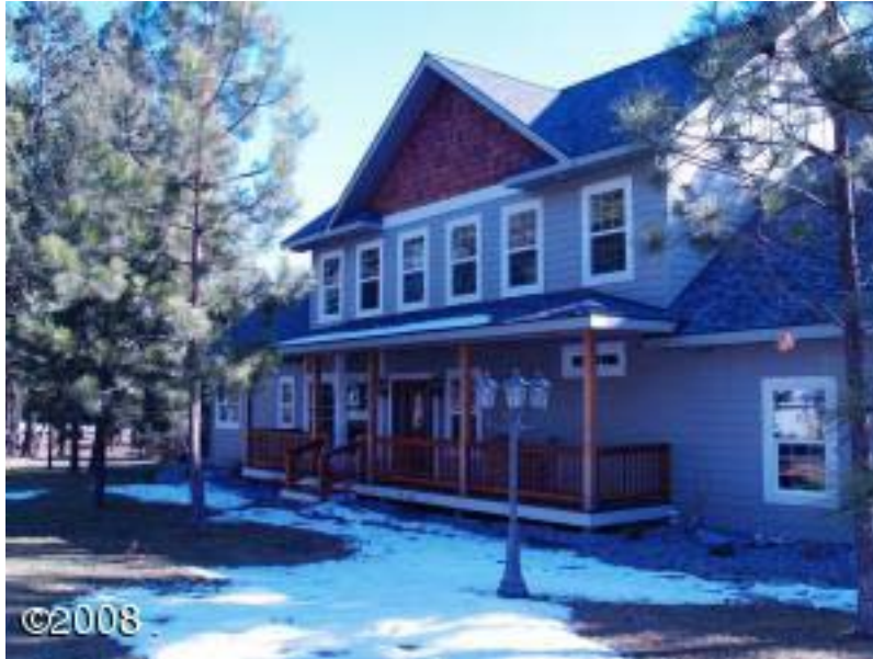
[1 of 18] ExteriorFront Exterior