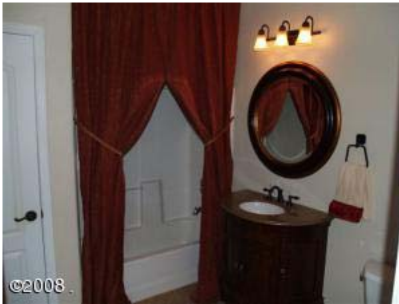
[9 of 18] Upstairs BathUpstairs Bath