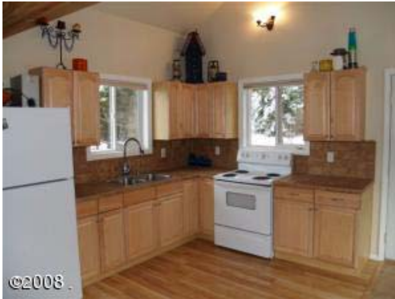
[17 of 18] Guest QuartersGuest Quarters