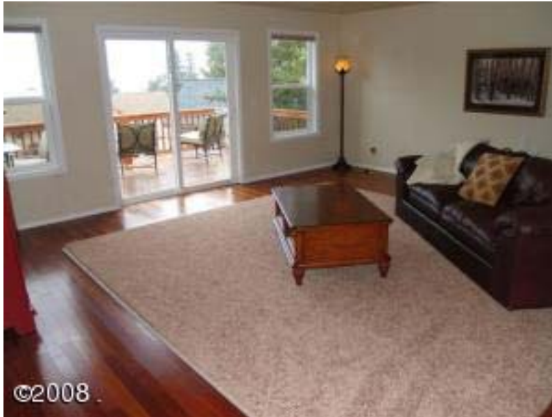
[11 of 18] **