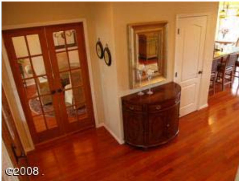
[2 of 18] **