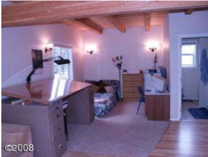
[16 of 18] Guest QuartersGuest Quarters