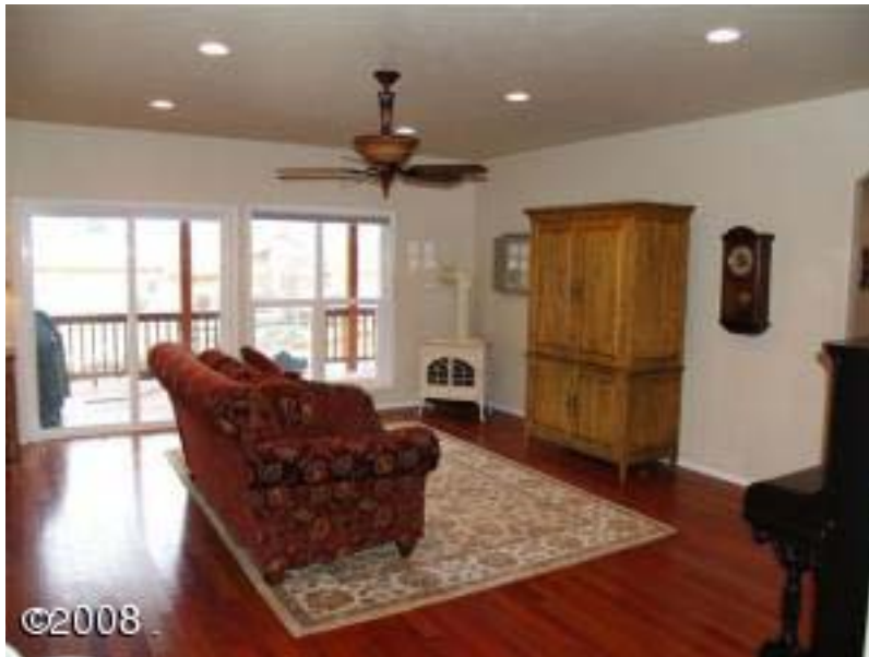
[10 of 18] **

Information current as of: 2008-06-08 05:48:25.0