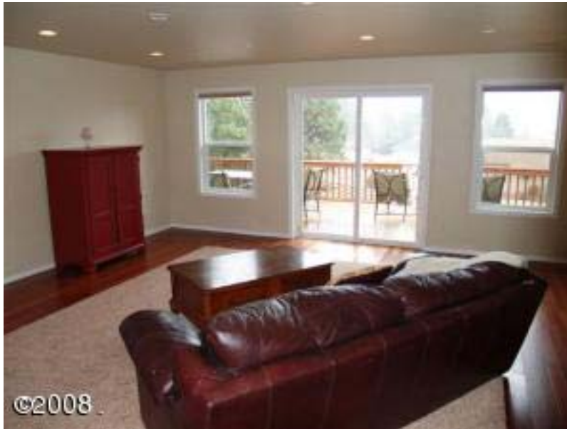
[12 of 18] **