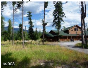
Main Photo 1