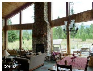
Main Photo 2