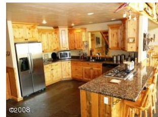
Main Photo 3